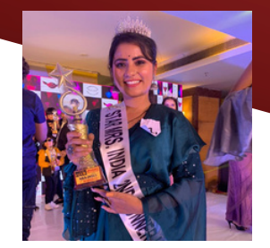
Second Runner up Mrs India 27th December 2022