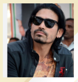
Model and Bollywood actor Celebrity Guest